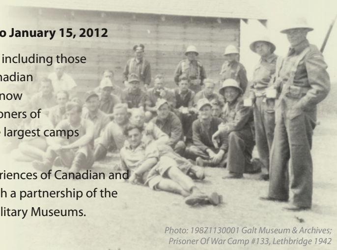
Photo: 198Z1130001 Galt Museum & Archives; Prisoner Of War Camp #133, Lethbridge 1942

This first person exhibit compares the prison experiences of Canadian and German POW's. The exhibit was developed through a partnership of the Galt Museum & Archives of Lethbridge and The Military Museums.