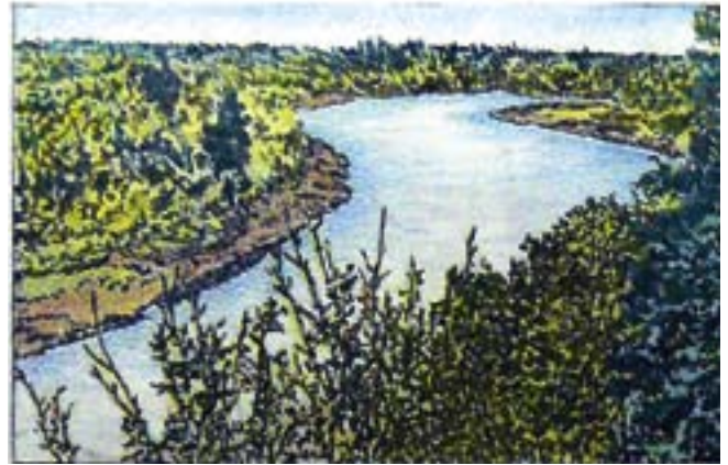
Matheson, Red Deer River, 1994, hand coloured lithograph

Exhibition Reception: Friday, July 2, 7:00 - 8:30 pm