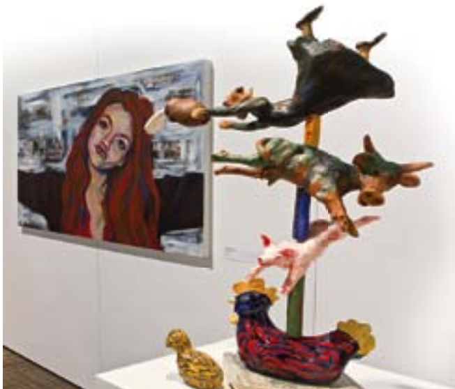
2011 RDC student show

Opening Reception: March 14, 7:00 - 9:00 pm