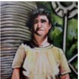
Alberta Farm Women: Works by Dawn Saunders - Dahl September 17 - November 21