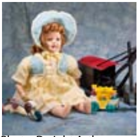
MAGnificent Toys October 29, 2010 - January 9, 2011 MAG Collection

Ada Fors Bergstrom, c. 1920