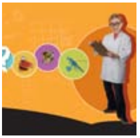
Top Secret: mission toy October 22, 2010 - January 09, 2011 Organized by the Canadian Museum of Civilization