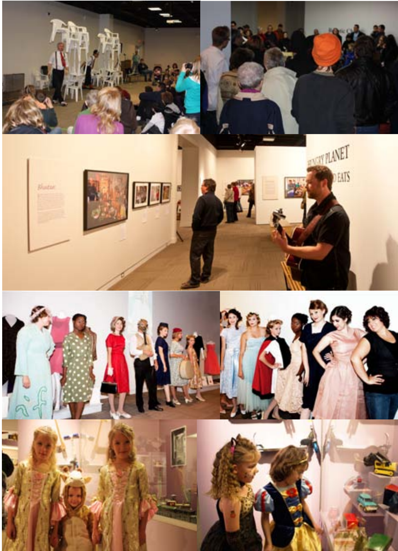
From Top Left: Transformation Celebration: Family Day 2010; Grand Opening, May 1, 2010; In Between Charming & Romantic Fashion Show, August 2010; Halloween at the MAG 2010

Individuals with a passion for heritage and sound business and board skills are strategically recruited to serve on the Red Deer & District Society's Board of Directors. Currently, the 12-member governance board is comprised of the Executive Committee, several standing Committee Chairs and appointed representatives from within the community.