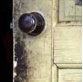
Farm Fragments: Installation by Jean Pederson September 10 - November 14