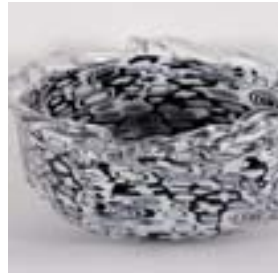
Glass 2009 July 9 - September 26 AFA Collection