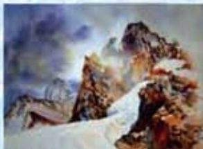
In the Purcell Mountains, Jerry Heine, watercolour

These artists share the beauty of our mountains and focus our attention on the need to preserve our natural heritage for all creatures.