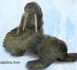
Tusked Walrus Rearing Over its Young, Padijya Qutluk, soapstone, bone

Explore life north of the Arctic Circle through the eyes of Inuit printmakers, sculptors and artisans. Works of art and artefacts selected from the collections of the Red Deer Museum + Art Gallery.